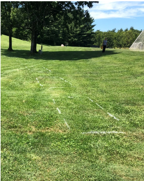
One family per rectangle