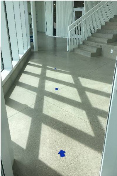
Follow the arrows